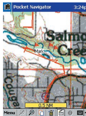
Geocache track in park