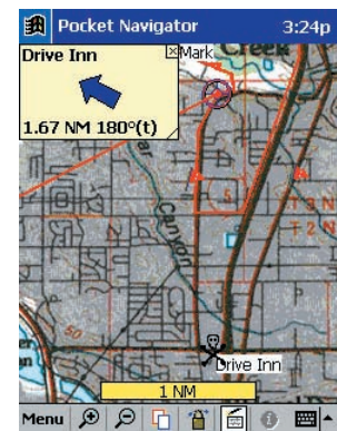
Overall city view of geocache track